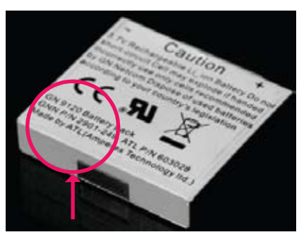
Batteries "Made by ATL" must be replaced by a Synergy battery with sticker.