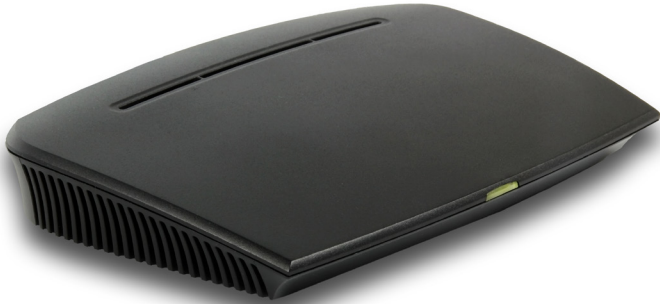
Konftel IP DECT 10