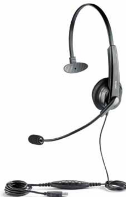
Jabra BIZ™ 620 USB Mono 6293.823.309 MSRP: $59.00