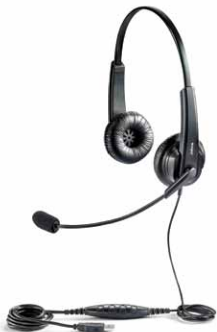
Jabra BIZ™ 620 USB Duo 6299.823.309 MSRP: $69.00