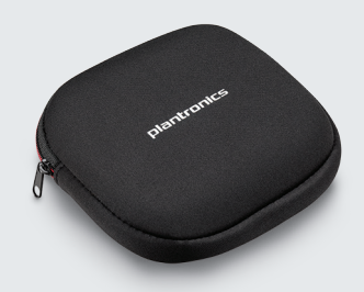
Soft carrying case