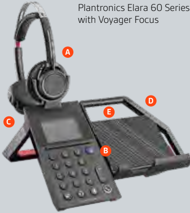
Plantronics Elara 60 Series with Voyager Focus