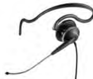
Jabra GN2100 Monaural, SoundTube Boom, w/Neckband

For the ultimate in hi-fi stereo sound, the Jabra GN2100 is also available in a plug-and-play, Microsoft Windows® compliant USB version with in-line sound controls.