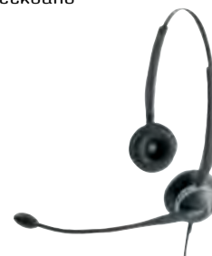
Jabra GN2100 Binaural, Flex Boom, w/Headband