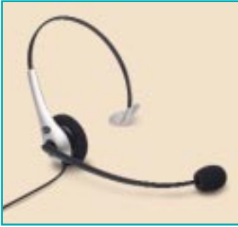
GN 2220 Omega™ monaural headset.

GN 2200 Omega headsets feature noise-canceling microphones and easily-positioned DuraFlex-II mic booms. The GN 2225 binaural features two oval speakers and a single, lightweight DuraFlex cord for added comfort and convenience.