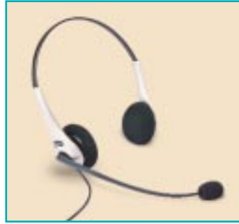
GN 2225 Omega™ binaural headset.