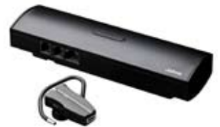
Jabra JX10 Series II Multiuse with Hub

The Jabra JX10 Series II Multiuse with Bluetooth hub is as attractive as it is functional.