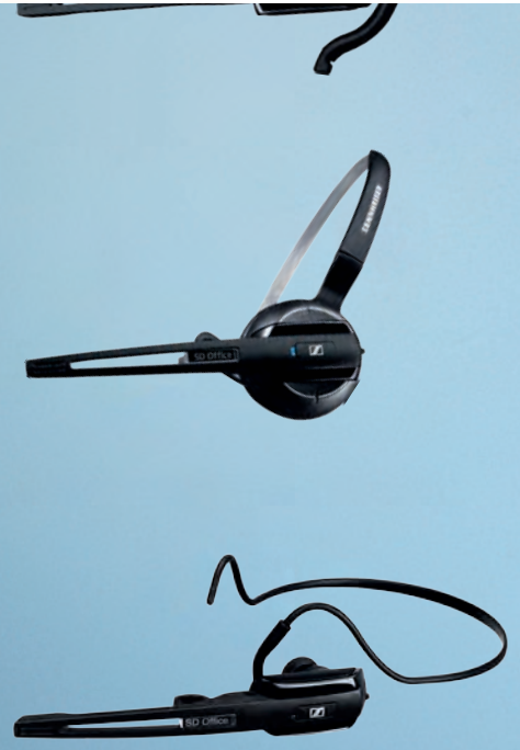
Note: Neckband available as accessory