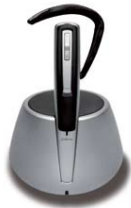
Jabra T5330 Multiuse

Developed for the active professional in the office, the Jabra T5330 Multiuse is very easy to use and compatible with most phones. It gives you up to 33 feet of wireless freedom both inside and outside the office.