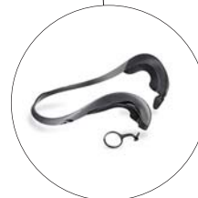
Optional neckband for behind-the-head wearing style