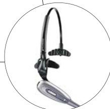
Optional dual "T-pad" headband