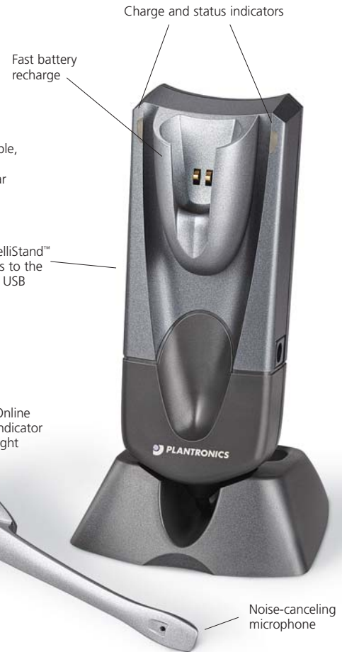
Charge and status indicators