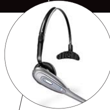
Includes over-the-head uniband for added stability