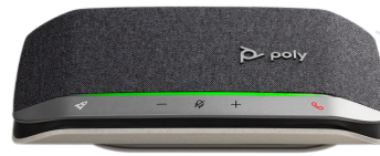
POLY SYNC 20