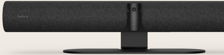
Table stand is sold separately as an optional accessory.

With an array of intelligent experiences, PanaCast 50 brings remote participants into the meeting room to make hybrid working work.