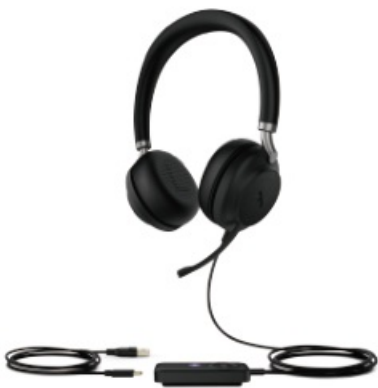
UH38 Dual Teams-BAT UH38 Dual UC-BAT